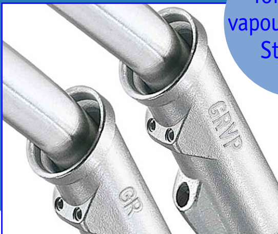
GR + GRV