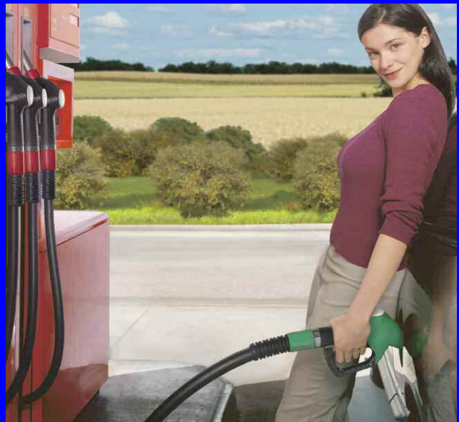
BIO-FUELS Mixtures i.e. with Ethanol