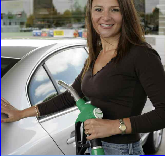
GASOLINE without vapour recovery

Tel. +49 (040) 540 00 50 Fax +49 (040) 540 00 567 E-Mail info@elaflex.de Internet www.elaflex.de