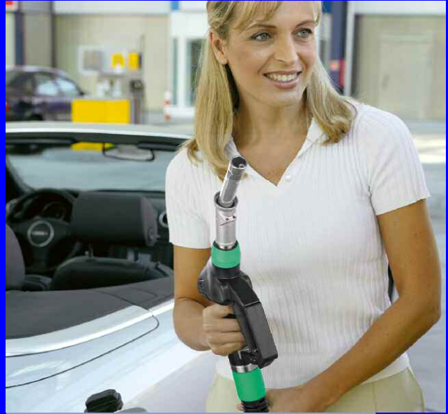
ACTIVE VAPOUR RECOVERY